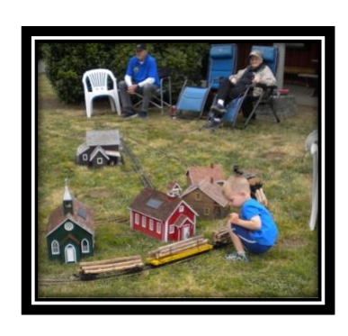
"Train Love" Burt Maxwell looking on