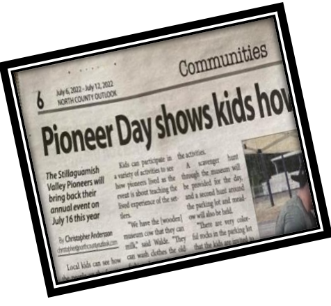
GREAT coverage in local news both before and after Pioneer Day!