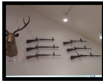
Part of the gun display as shown in the Library. Rex Martin has been instrumental in getting these displays organized.