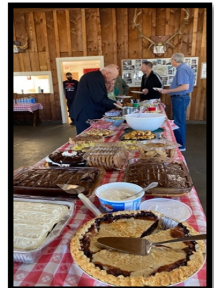
As always, plentiful & delicious food!